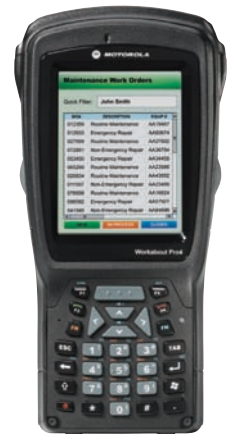
Workabout Pro 4 Short Shown with Numeric keypad.

(Workabout Pro 4 Long is shown on the front page with the Alphanumeric keypad.)